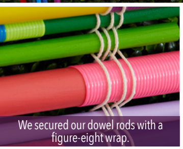
We secured our dowel rods with a figure-eight wrap.