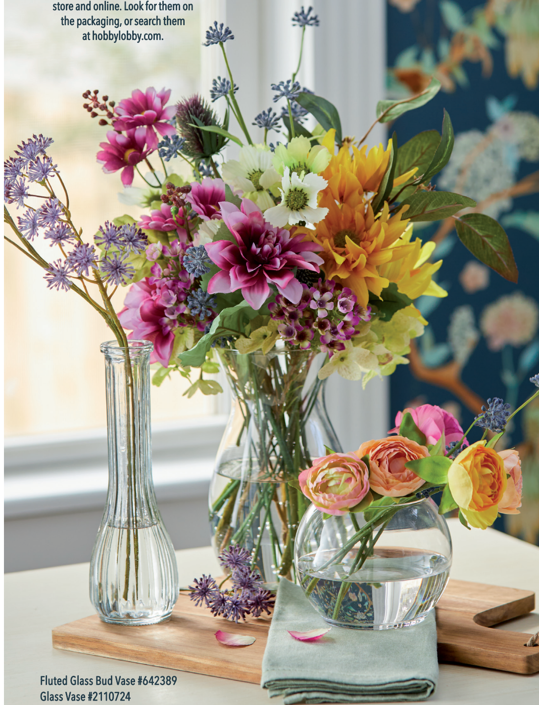
Fluted Glass Bud Vase #642389 Glass Vase #2110724 Bubble Ball Vase #606566

We've provided SKU numbers to help you find these products in store and online. Look for them on the packaging, or search them at hobbylobby.com .