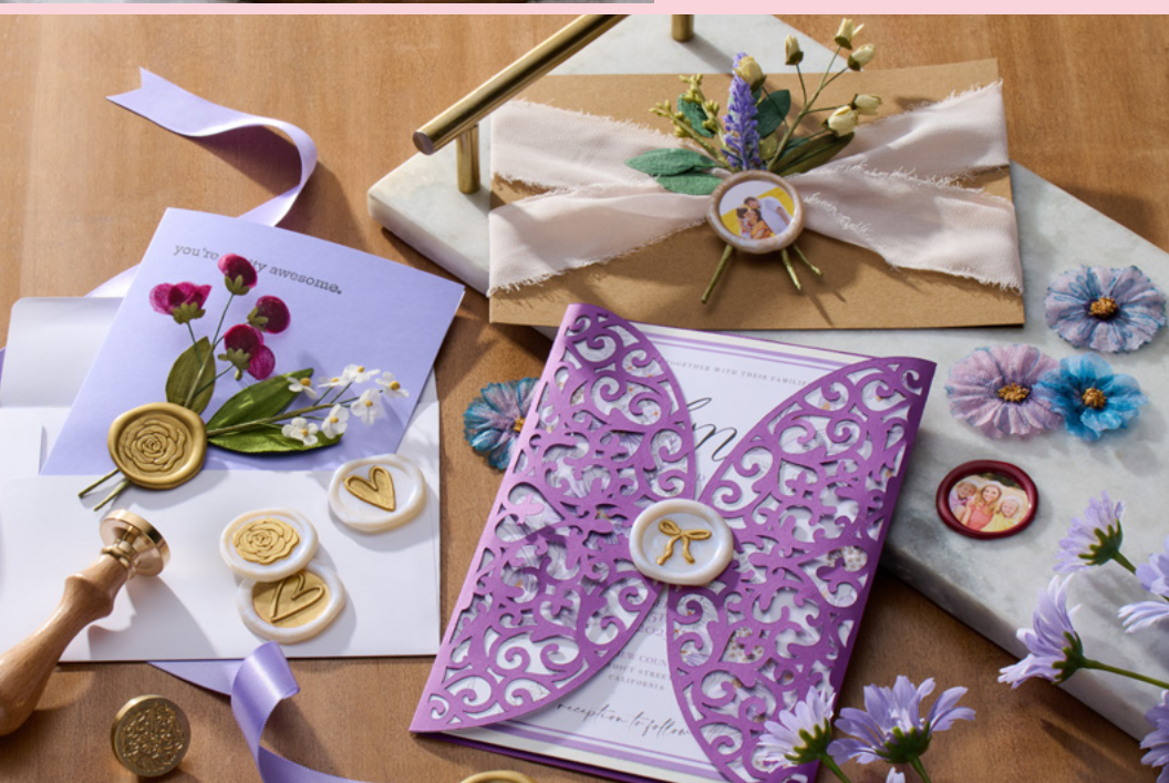
Photo: Make a wax seal, then glue a photo in the center.

Two-toned: Make a wax seal, cut out the stamped design (bow, heart & flower shown here), place the cutout back onto the stamp, then use the stamp again to make the finalized wax seal.